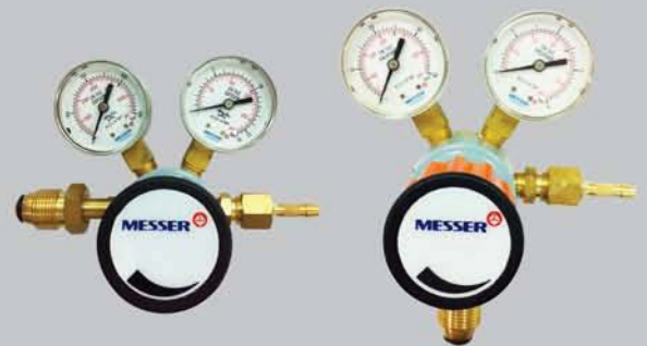
TYPHOON series B